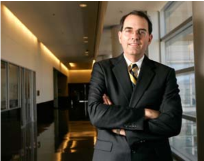
Judge Jay Bybee, Ninth Circuit U.S. Court of Appeals